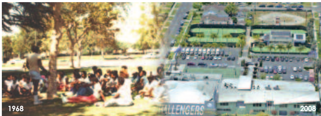
If, as the saying goes, life begins at 40, then Challengers is just getting started!